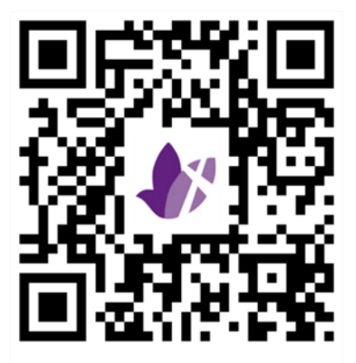
St Matthew's Uniting Church Roof project https://ppay.co/yPISBT5-1DA

Pushpay is our giving platform that allows 1 off or recurring donations by Visa/Mastercard credit or debit cards. Here is a link to the giving page, just point your phone camera to this QR code.